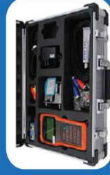
Aluminum Alloy Box