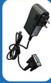
Charge (Power supply)